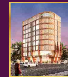
SHIVESH SAPPHIRE PLOT 271, SECTOR 26, ULWE