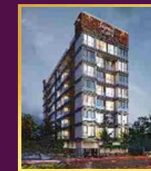
SHIVESH AURIUM PLOT 96 & 102, SECTOR 11, KHARGHAR