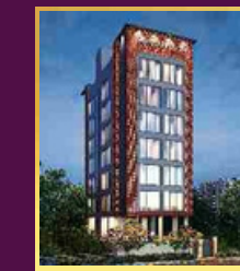
SHIVESH EMERALD PLOT 118, SECTOR 7, AIROLI