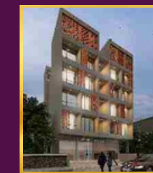
SHIVESH REVATI PLOT 310, SECTOR 24, ULWE