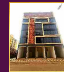
SHIVESH ANANDI PLOT 300, SECTOR 24, ULWE