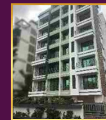
SHIV JINAL PLOT 169, SECTOR 23, ULWE