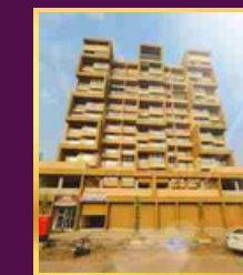
ORCHID BLISS PLOT 72, SECTOR 5, ULWE