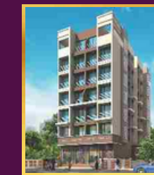
SHIVESH OPAL PLOT 291, SECTOR 26, ULWE