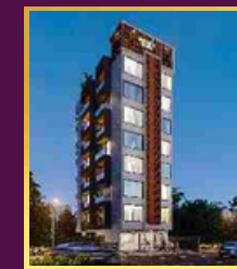
SHIVESH ANANTA PLOT 175, SECTOR 24, ULWE