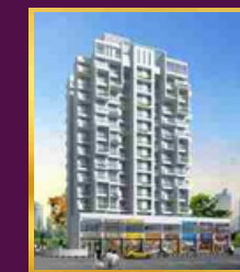
ORCHID HEIGHTS PLOT 145, SECTOR 23, ULWE