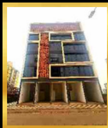
SHIVESH ANANDI PLOT 300, SECTOR 24, ULWE