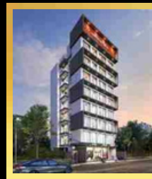
SHIVESH OPAL PLOT 291, SECTOR 26, ULWE