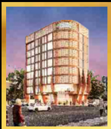
SHIVESH SAPPHIRE PLOT 271, SECTOR 26, ULWE