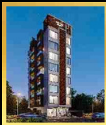
SHIVESH ANANTA PLOT 175, SECTOR 24, ULWE