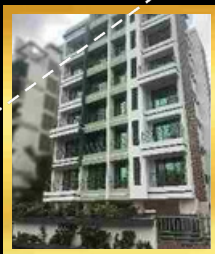
SHIV JINAL PLOT 169, SECTOR 23, ULWE