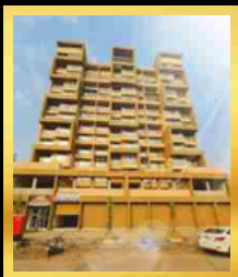
ORCHID BLISS PLOT 72, SECTOR 5, ULWE