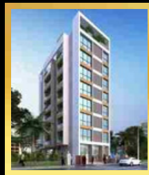
SHIVESH DAMODAR PLOT 178, SECTOR 24, ULWE