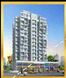
ORCHID HEIGHTS PLOT 145, SECTOR 23, ULWE